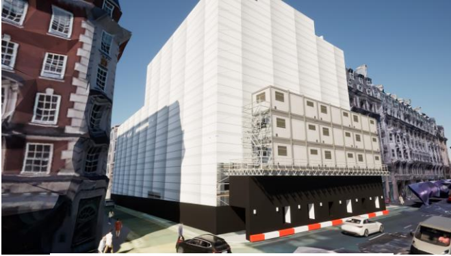
Hoarding and scaffold arrangement Piccadilly Rd and Duke St

In early January 2024, work will start by forming the new hoarding around the building perimeter and assembling scaffolding, with a gantry to be installed along Piccadilly as agreed with Westminster City Council.