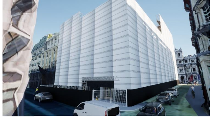
Hoarding, scaffold and pit lane arrangement Duke St and Jermyn St